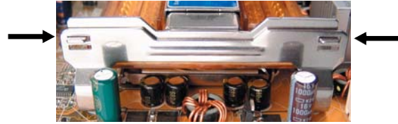
(Top Holes) Clip alignment WITH Spacer

For CPU-300 models, the top rail holes are used with the LGA 775 Spacer. If the Spacer is not used, the bottom holes will receive the bracket clips. For CPU-305 models, the bottom holes are always used without the spacer.