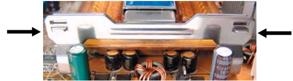
(Bottom Holes) CPU-300 clip alignment WITHOUT Spacer, or for CPU-305