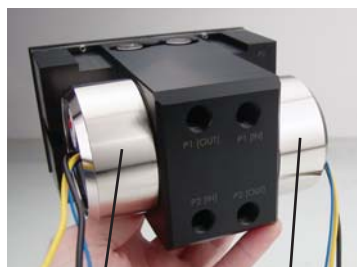
Pump #1 ("P1")

To mount the second pump, repeat the above process for the opposite side of the RP-450X2.