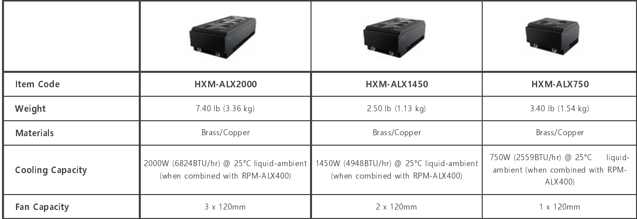
Plate Heat Exchangers

Koolance ALX 시리즈의 모듈식(확장형) 냉각 시스템용 열교환기 장치입니다.