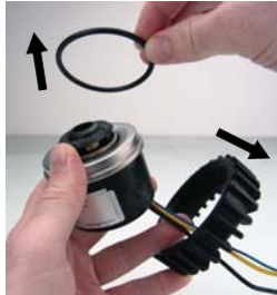
Original pump o-ring (not used)

The pump must be disassembled for installation. Unscrew the large ribbed collar on the pump by hand or with a strap wrench.