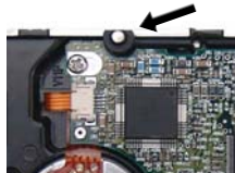
HD-55 Mounting Peg

Instead of screwing hard drives directly to the liquid cooler, they are attached with pegs. These need to be hand-tightened into each of the four bottom screw holes on the hard drive. The pegs do not need to be especially tight.