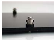
HD-57 Mounting Peg

For the HD-55, rotate each peg until the flatter portion is facing toward the outside of the hard drive. The HD-57 has symmetrical pegs that do not require any special alignment.