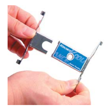
The P-4 socket 478 bracket clips (included with CPU-300/305 coolers) are used for LGA 775 boards. Assemble the bracket by inserting these clips into the center slider.

The temperature sensor should already be installed into the CPU Cooler. (Please see the CPU-300 or CPU-305 installation sheet for more details.)