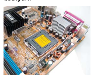
CORRECT: rails parallel to socket locking arm

INCORRECT: rails perpendicular to socket locking arm