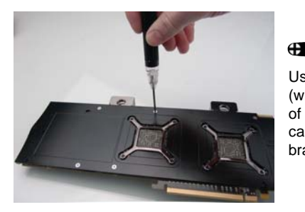
Place the Koolance water block onto the video card.

Place the cut heat transfer pads on each area cooled by the Koolance liquid block, as determined by the thermal pad diagram.