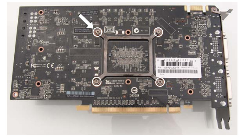
GTX 460 Disassembly Screws

All heat sink assembly screws should be removed. There should be 4 or more of these on the back of the video card. Also check below stickers and pads.