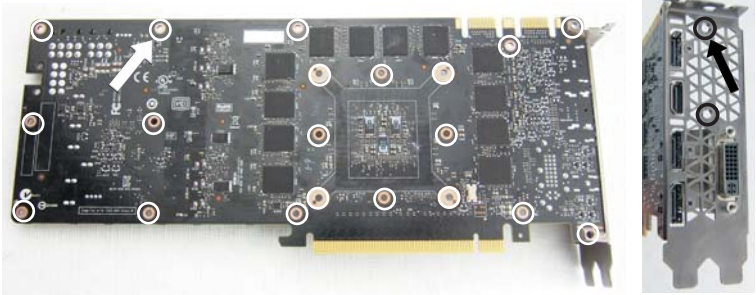
Titan X Disassembly Screws (Bottom and Rear L-Bracket)

All heat sink assembly screws should be removed. There are multiple screws on the rear of the video card, and 2 more on the L-bracket.