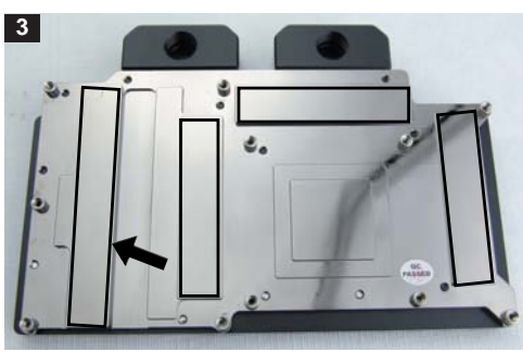
VID-NXTTNX Water Block Thermal Pad Locations

If you purchased the optional Koolance back plate, apply thermal padding to the back plate per its included diagram.