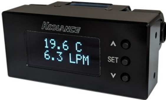
Flow meter and temperature sensor sold separately.

The DCB-FMTP01 can display the temperature and flow rate values from a Koolance 10K Ohm thermistor and flow meter (sold separately). It can also sound an audio alarm based on the flow rate or temperature. It requires 12VDC input power, and includes two different wiring harnesses.